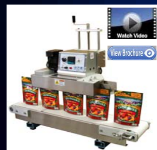
Shown above ▲ Tabletop Conveyorized Pouch Sealer

◆ FRESH PRODUCE ◆ SNACKS ◆ ◆ NUTRACEUTICALS ◆