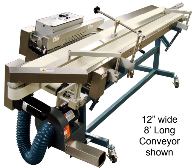
12" wide 8' Long Conveyor shown